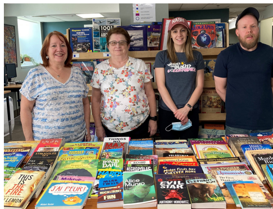
Book donations from The Retired Teachers of Ontario, Wellington District 31

Similarly, Action Read is financially supported by countless generous individuals, donors, foundations and government organizations. These funders provide the stable foundation from which our work grows and flourishes.