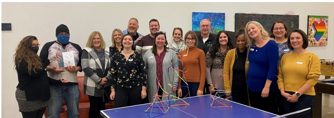
Staff of the 'All That Kids Can Be' Service Network